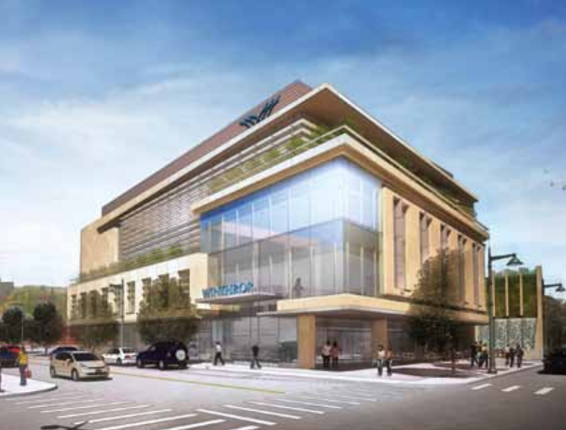
Winthrop Research and Academic Conference Center